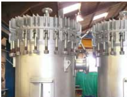
65110 SR Guard Filter