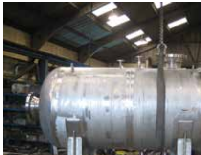
Sulphate Removal Unit

3 off super duplex vessels 1m diameter x 2.5m x 12mm thick. All internal filter bags fitted and assembled in-house. Filters boxed and shipped on time.