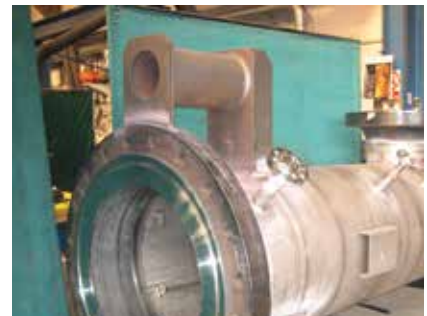
Vertical Gas Filters

3 x super duplex filters 1.5m diameter x 3m long x 25mm thick. ECF recoded all welders to comply with material changes and ASME code. Production did not stop and vessels were painted, packed, and delivered on time.